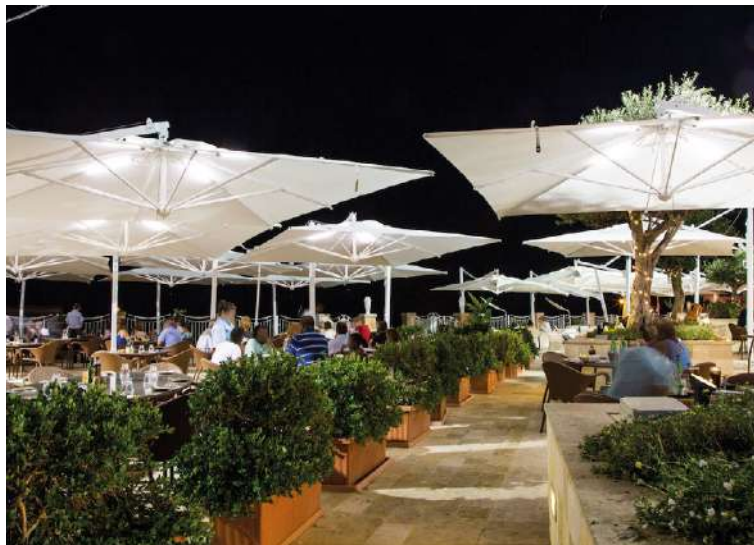
RADISSON HOTEL MALTA