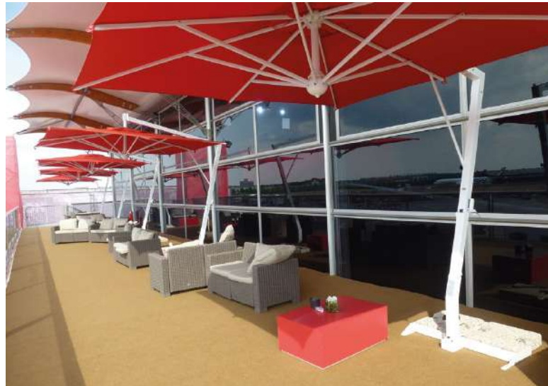
FARNBOROUGH AIRPORT - UK